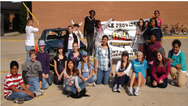
Crestview TREND Students after a successful Car Smash